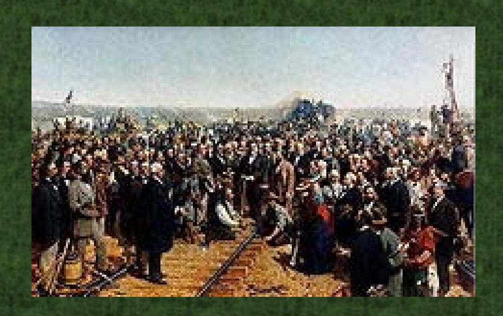
The Golden Spike Transcontinental Railroad May 10, 1869